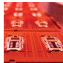
Die and Epoxy AOI