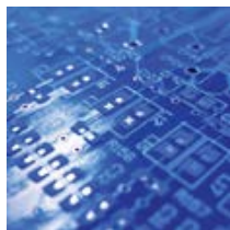
3D Paste AOI